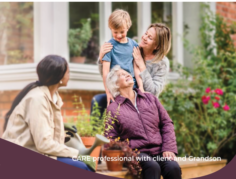
CARE professional with client and Grandson